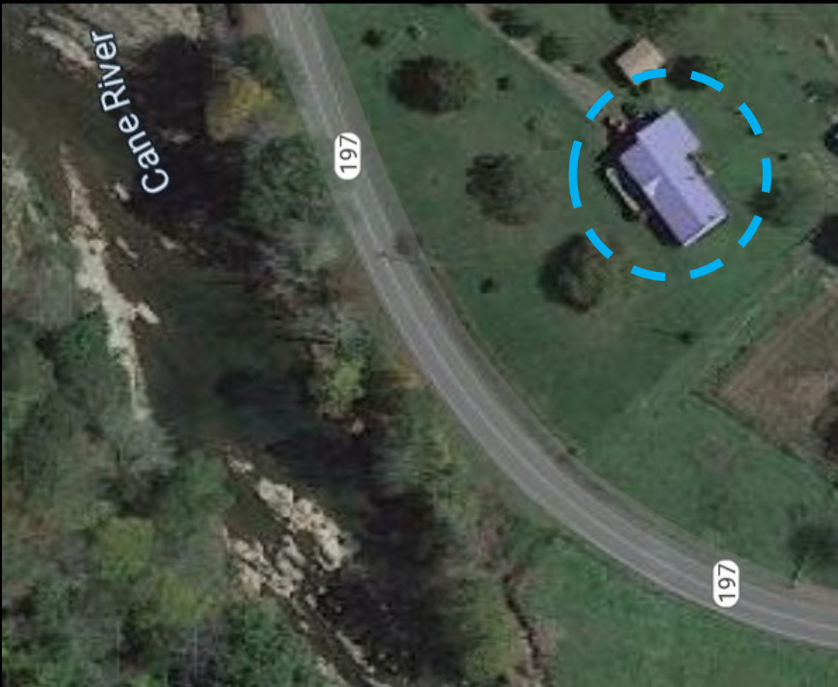
Photo from Google Aerial View